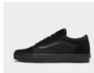
Black canvas lace up