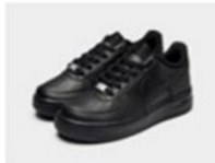
Black leather trainer