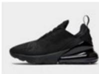
Black bubble trainer