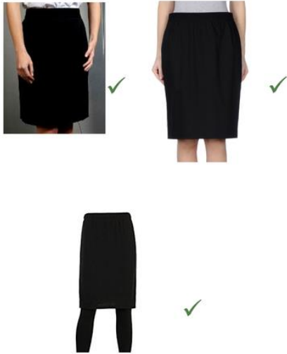
Examples of correct skirt length